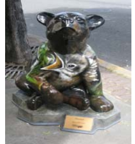
Keep your eyes open for the BearFest Bears returning to Rogue River for the Holiday Season!